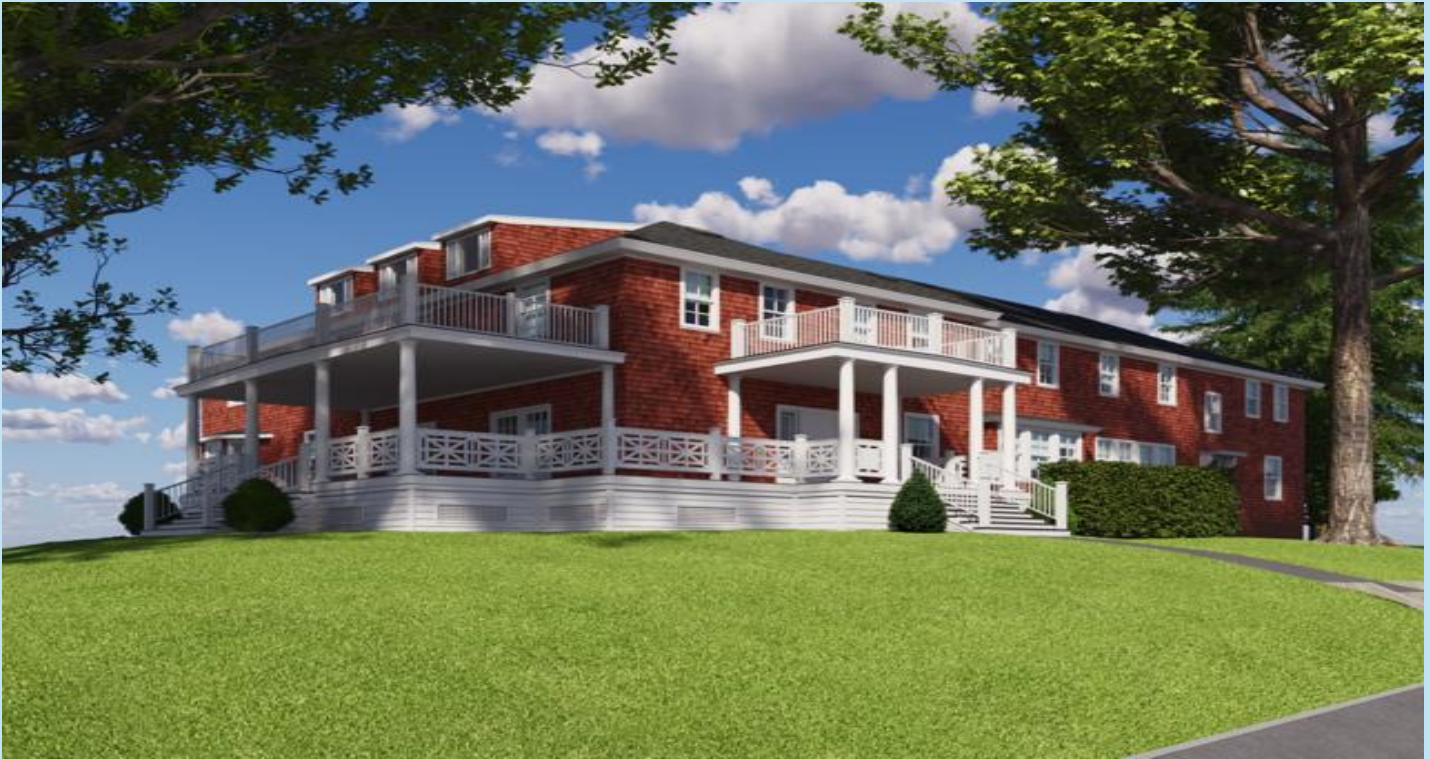
Figure 1-Front of House from College Ave