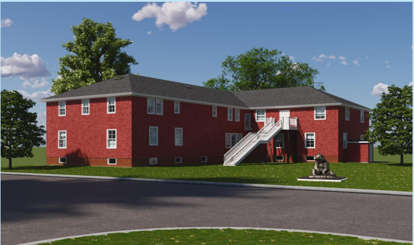
Figure 2- Munson Ave view – Original home of Bananas the bear!