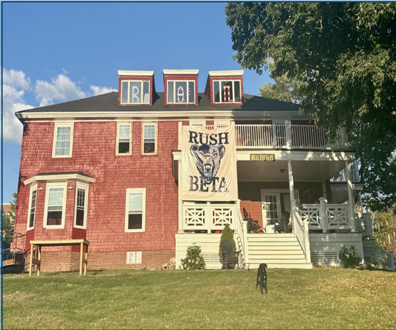
Fresh coat of paint