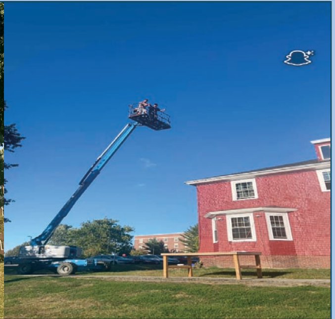
Boys reaching high spots